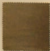
Family room leather ottoman Burton James: New Delhi, Chocolate