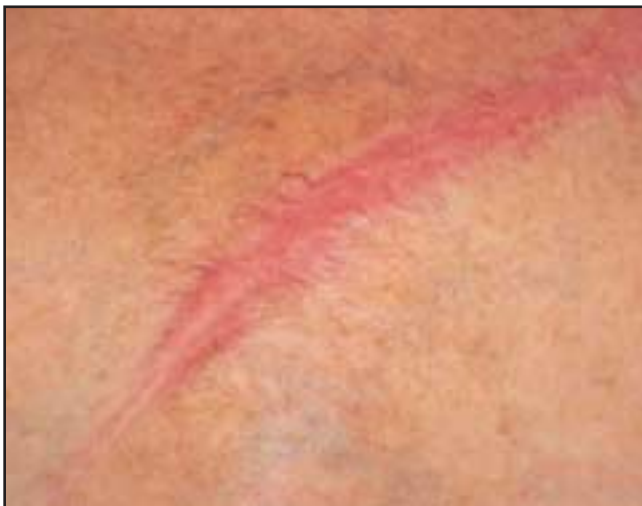
Fig. 1. Typical clinical appearance of a hypertrophic scar.

Hypertrophic scars usually occur shortly after injury (weeks) and may regress with time as compared with keloids which may manifest months to years after the initial injury and do not show a tendency towards regression. [5,6] One study demonstrated an average of 30.4 months between injury and the development of a keloid. [7] Others utilize a temporal definition to differentiate the types of scarring, suggesting that a hypertrophic scar that is present for 12 months, with extension beyond the original site of injury, has evolved into a keloid. [8] Hypertrophic scars may be more responsive to treatment, whereas keloids are often resistant to treatment and have a higher rate of recurrence. [9]