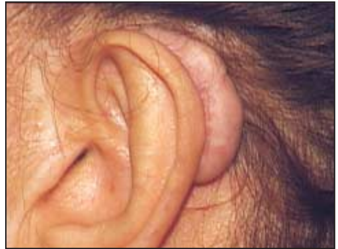
Fig. 3. Keloid recurrence after excision and continuous use of pressure earrings.

Radiation therapy is infrequently used as monotherapy. When combined with surgical excision, the recurrence rate following radiation treatment has been reported between 10–20%. [64,65] A