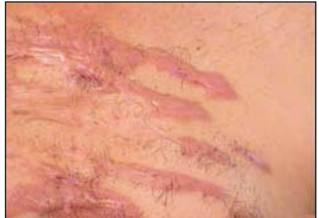
Fig. 2. Typical clinical appearance of a keloid.